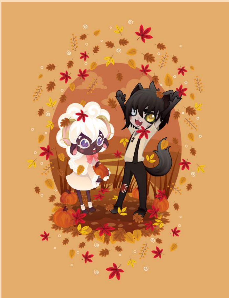
"Fall Has Arrived"