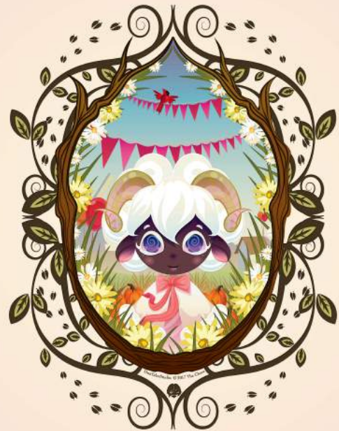
“Fluffy Sheep Among The Prairie”