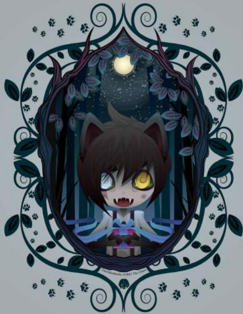
“Vicious Wolf Under The Moonlight”